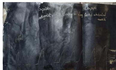
Fig. 2. Bioassay

The sample of Dioscorea Mexicana was found to be an antagonist.