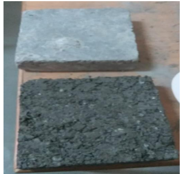
Fig. 1. Normal and electronic block

by an arbitrary no 100.The larger the figure, the coarser is the material and having a fineness modulus more than 3.2 will be unsuitable for making satisfactory concrete.