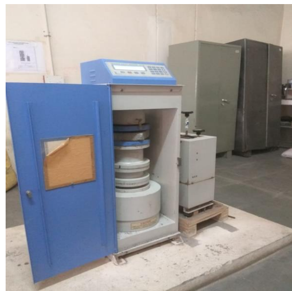
Fig. 2. Compressive test of normal block

The compressive strength of hardened cement is the most important of all the Properties. Therefore, it is not surprising that the cement is always tested for its strength at the laboratory before the cement is used in important works. Strength test are not made on neat cement paste because of difficulties of excessive shrinkage and subsequent cracking of neat cement. Strength of cement is indirectly found on cement sand mortar in specific proportions. The standard sand is used for finding the strength of cement. It shall conform to IS 650-1991.Three cubes are tested for compressive strength at the periods of 3 days, 7 days and 28 days. The strength of our used cement was found out to be 43N/mm 2 at 28 days.