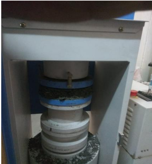
Fig. 3. Compressive test of e-waste block