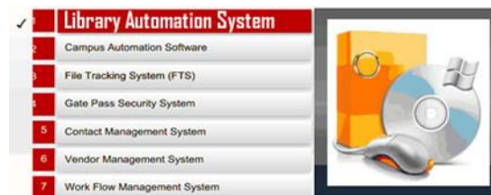
Fig. 4. Library automation system

to make things easier to access and retrieve by those with computers and network connections.