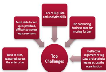
Fig. 4. Challenges of big data