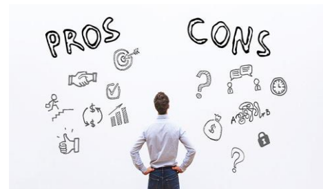
Fig. 3. Pros and Cons of big data

For process big data, timeliness is a vital purpose to be thought of. We tend to need data processing and new analytic algorithms for ensuing unjust data. Data processing techniques that currently directly apply for intra-node similarly, which suggests hardware resources appreciate processor caches and processors memory channels area unit shared across one node. There are a unit several things wherever the results of the analysis is needed forthwith [7].