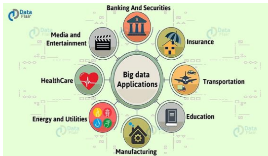
Fig. 2. Applications of big data

By victimization big data, students have deployed a learning and management systems. Manipulating this situation once the student or school logs on to the their portal or system, it'll show the small print concerning their operating hours and pages [1], [2].