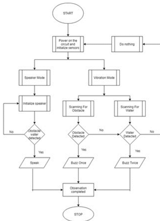
Fig. 1. Proposed system flowchart