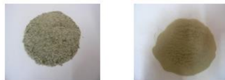
Fig. 2. The blast furnace slag powder used for synthesis of ALBF slag composites (a) as received Condition (b) after heat treatment condition