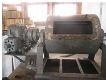
Fig. 3. Representative motions inside the jar of ball mill