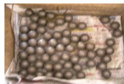
Fig. 1. Representative of balls used for making blast furnace Slag fine powder