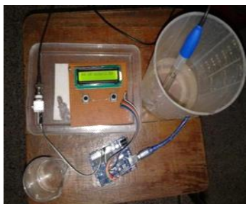
Fig. 4. The pH measurement setup

and displaying it on the LCD panel. The experimental setup for pH measurement is as shown in fig.4. The reading set comprised of 20 readings of the same quality sample and volumetric dilution of sample is done by mixing measured quantity of adulterant in it.