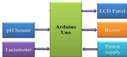
Fig. 2. Block diagram of Milk parameter measurement system

epitomizes the minimalist mantra of only making things as complicated as they absolutely need to be. Its design is not entirely new or revolutionary, beginning with a curious merger of two, off-the-shelf reference designs, one for an inexpensive microcontroller and the other for a USB-to-serial converter, with a handful of other useful components all wrapped up in a single board. Its predecessors include the venerable BASIC Stamp, which got its start as early as 1992, as well as the OOPic, Basic ATOM, BASICX24, and the PICAXE.