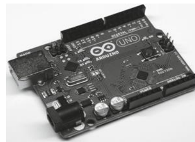
Fig. 1. The Arduino Uno interface board

Arduino is a flexible programmable hardware platform designed for artists, designers, tinkerers, and the makers of things. Arduino's little, blue circuit board, mythically taking its name from a local pub in Italy, has in a very short time motivated a new generation of DIYers of all ages to make all manner of wild projects found anywhere from the hallowed grounds of our universities to the scorching desert sands of a particularly infamous yearly arts festival and just about everywhere in between. Usually these Arduino based projects require little to no programming skills or knowledge of electronics theory, and more often than not, this handiness is simply picked up along the way. Central to the Arduino interface board, shown in Fig. 1, is an onboard microcontroller—think of it as a little computer on a chip.