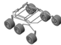
Fig. 1. Wheels using mars rover mechanism

The speed efficiency is increased with the help of mars rover mechanism which is able to run on terrains without resisting the speed. This mechanism makes use of six wheels each having a motor. The front and rear wheels also have single steering motors individually. This steering unit makes the machine to turn full 360 degrees round. The four steering wheels helps the rover to move across the curves and rocky planes enabling it to move smoothly over the terrains. The maximum angle it can offer is about 65 degrees. However researches are going on to increase its angle so that it can cross about more than 65 degree obstacle coming across its path. The most important thing when designing suspension is to look into the fact that the system should be able to change its position dramatically when crossing a rocky path.