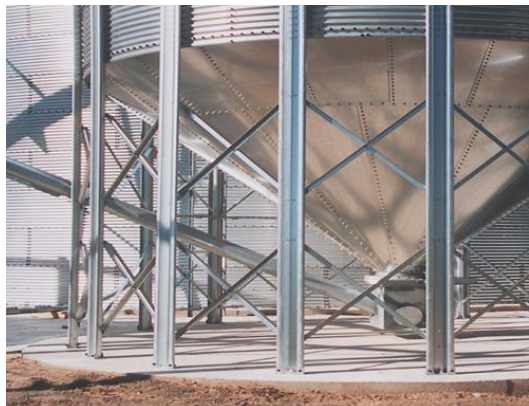
Fig. 2. X-bracings

in RC frames. Steel bracing of RC buildings started as a retrofitting measure to strengthen earthquake-damaged buildings or to increase the load resisting capacity of existing buildings.