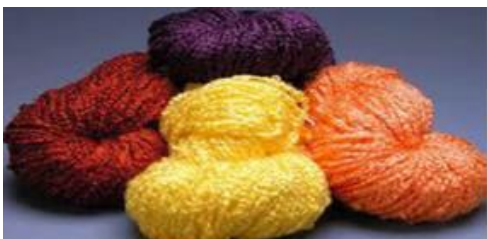
Fig. 3. Polymer fibre

The homogeneity of the concrete matrix is much improved by the uniformity distributed fibers throughout the concrete. The toughness and tensile strength are increased, the cracking and deformation are improved by the use of polymer fibers [2]. But this method adds another layer, which is prone to degradation when exposed to marine environment due to surface blistering. As a result, the adhesive bond strength is reduced.