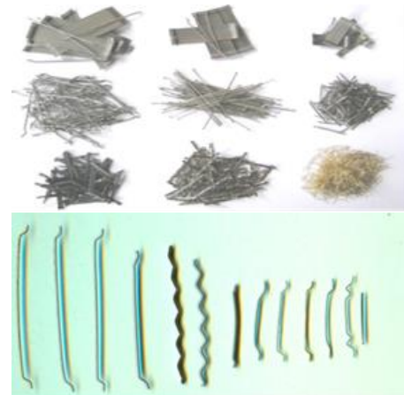
Fig. 1. Steel fibers

Steel fibers are those consisting of cement concrete mix and steel as fibers. This mix, have large number of volume fractions, geometries, orientations and material properties. Steel fibre increases properties like ductility, energy absorption, shear resistance and stiffness. The steel fibers can be straight, crimped, twisted, hooked, ringed and paddled end. Diameter can range from 0.25 to 0.76 mm [5].