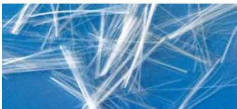
Fig. 2. Glass fibers

Glass fibre-reinforced concrete is (GFRC) concrete composition which is composed of material like cement, sand, water, and admixtures, in which short length discrete glass fibers are dispersed [2]. The flexure strength of glass fibre can be increase to 130% when compare with ordinary plan concrete [4].