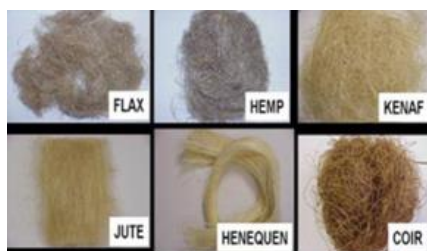
Fig. 4. Natural fibers

In addition to industrial fibers, natural organic and mineral fibers have been also investigated in reinforced concrete. Wood, sisal, jute, bamboo, coconut, asbestos and rock-wool, are examples that have been used and investigated. Natural fibers have relatively, high strength, high stiffness and low density. Because natural fibers are easily available materials, they are not uniformly in diameter and length. Typical values of diameter for natural fibers vary from 0.004 to 0.03 in. (0.10 to 0.75 mm).