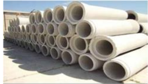
Fig. 8. Precast concrete sewer pipes. Reinforcing precast concrete pipes using only steel fiber is economically advantageous for pipe diameters up to 36 in. (900 mm)