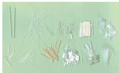
Fig. 5. Synthetic fibers

Synthetic fibers are not suitable for primary reinforcement in concrete because they add small or no strength. The synthetic fibers are often chosen as secondary gradient by the contractors as these gives benefit while the concrete is in still plastic state as compared to the plain reinforced concrete. They also enhance some of the properties of hardened [2].