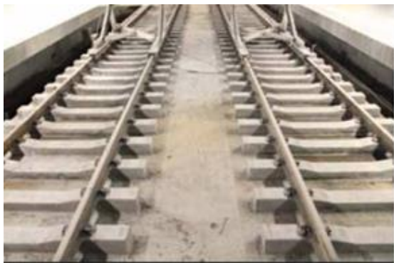
Fig. 6. Precast concrete railroad track slabs for high-speed trains.