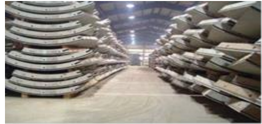
Fig. 7. Segmental tunnel lining using steel-FRC