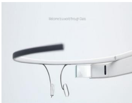
Fig. 2. Glasses