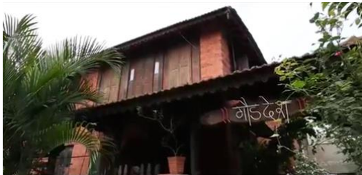
Fig. 2. Eco-friendly house

It is a double storey house where they have used Mud as a mortar and as a plaster. Flooring is also a Mud flooring that is beneficial to health. Have Mud roof tiles which is excellent ventilator and requires no fans. They have save 31000 of cement and 4500 kg's of steel.