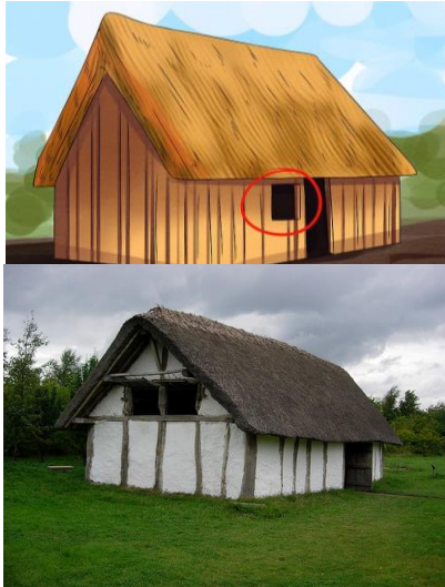
Fig. 1. Medieval era windows

Most houses were made of wood, so windows were little more than holes in the wall. Windows were simply incorporated to enable light to come into the home, and animal skins would have been put in front of the window for insulation. (Fig. 1) After this more and more building are made of stone. Now Mullins are made of stone and timber. (Fig 2)