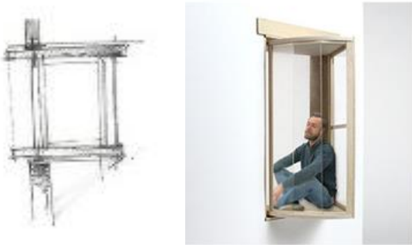
Fig. 7. Collapsible casement window