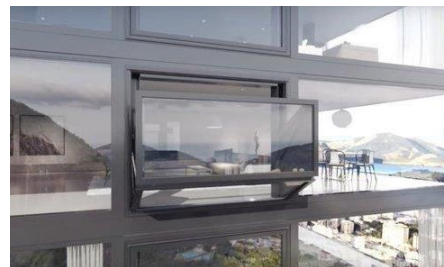
Fig. 5. Why not in place of grills cage they can use the convertible window