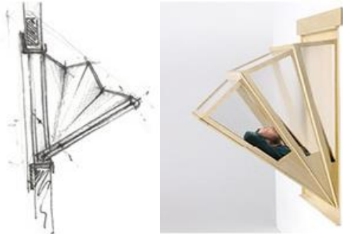
Fig. 6. Collapsible Hooper type window