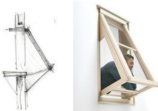
Fig. 8. Collapsible awing window