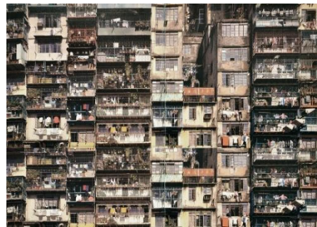
Fig. 4. In Mumbai apartment, they use the grills to extend the space

In the congested urban settings, we inhabit, with pigeon-hole sized apartments being the norm rather than the exception; windows are usually the only source of natural light and ventilation. A balcony is the urban apartment-dwellers most luxurious form of access to the sky. And in the restrictive real estate scenario, balconies in low to mid-level apartment blocks have become virtually extinct. The comparison in space we can see in Fig. 4 and Fig. 5.