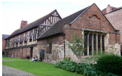
Fig. 2. Stone window