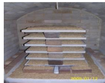
Fig. 2. Raw Rice Husk (RRH)