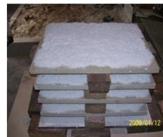
Fig. 3. Rice Husk Ash