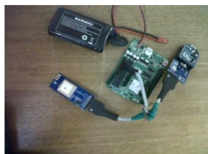
Fig. 6. Node

The node shown in Figure 6 placed on neck of the cow has the GPS to find the exact location of a cow using the longitude and latitude data available in our system. This data is stored in the data base available on the server we can find the animals using these data using Google maps.