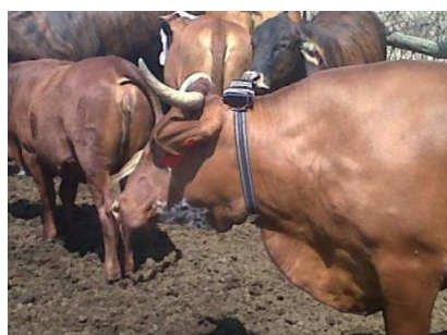
Fig. 7. Node worn by the cow