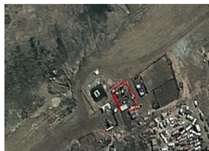
Fig. 5. Boundary of the enclosure

The node shown in Figure 6 placed on neck of the cow has the GPS to find the exact location of a cow using the longitude and latitude data available in our system. This data is stored in the data base available on the server we can find the animals using these data using Google maps.