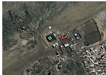
Fig. 4. Movement of the cow in the enclosure

We mapped the movement data using Google Maps as shown in Figure 4 and Figure 5. Figure 4 shows the movement of the cow within the enclosure, while Figure 5 shows the boundary of the enclosure.