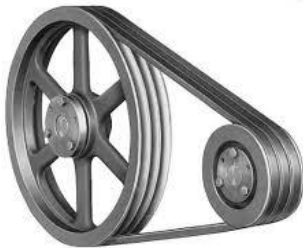
Fig. 4. Pulley and Belt

Pulley and belt use for couple the alternator shaft with the flywheel of gymnasium bicycle