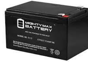
Fig. 5. Battery

A 12V 0.3Ah Battery use for store the electrical energy obtain from the alternator. Maximum 5hr required for full charge the battery on 1400Rpm of Alternator. Lead acid battery is use for this model.