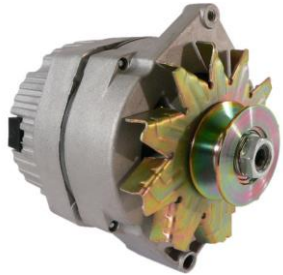
Fig. 3. Alternator

A 24V 10A Alternator are used for generation. It's externally exited type and self-rectified the output and produced DC output.