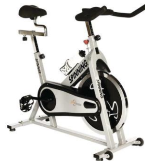
Fig. 2. Stationary Bike

To design a model which depicts a stationary bike, it was imperative to study the basic characteristics of a stationary bike. A stationary bike by design is basically a modified bicycle. It is designed for high intensity training which regular bikes cannot handle. Built from strong materials, mostly steel frames, these bikes are able to withstand a lot of pressure. The pedals are commonly connected to a gear which is fixed and constant resistance is provided by the flywheel mechanism. The flywheels usually varies in weight; the heavier it is the greater the momentum. Depicts a common stationary bike found in gyms across the world. The stationary bike is very similar to a bicycle. The only difference is that it does not move when pedaled and hence the term stationary. As the bike is pedaled the flywheel, located in the front, spins and builds momentum. It is designed to feel a lot like riding a regular bicycle.