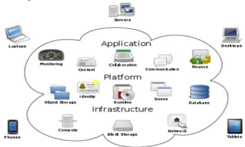
Fig. 1. Cloud computing technologies

There is a logical diagram of the cloud computing technologies as shown in Fig. 1.