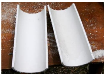
Fig. 3. PVC pipe

This height and diameter is chosen due to restriction of use of more rotor diameter due to available of less space to install on highway. In the project three blades with vertical shaft are used, it has a height & width of 750mm & 400mm respectively. The angle between two blades is 120 degrees. The material used For the blade is PVC pipe.