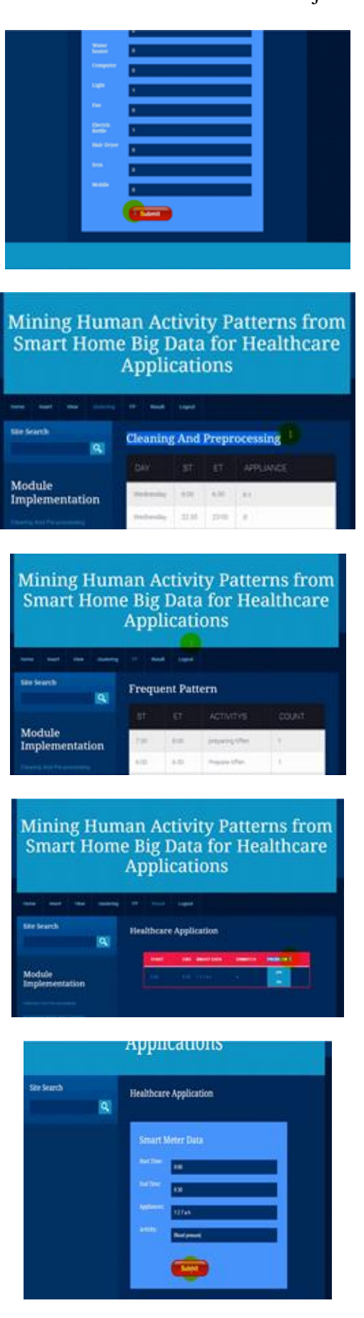
Fig. 1. Implementation of the module