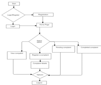
Fig. 1. Flow Chart

It displays the flow diagram of the PGRS system it displays the current system flow and it is displayed user will first have to login or register to the system in order to access the modules.