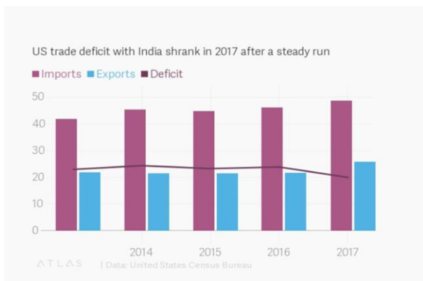
Fig. 2. United States census

These include stainless steel fittings, binders for factory moulds, structure of iron and steel, screws and bolts, a category of spring and cast articles of iron and steel, plates and sheets. Additional duty of as high as 50% has been proposed on motorcycle with an engine capacity more than 800 cc.