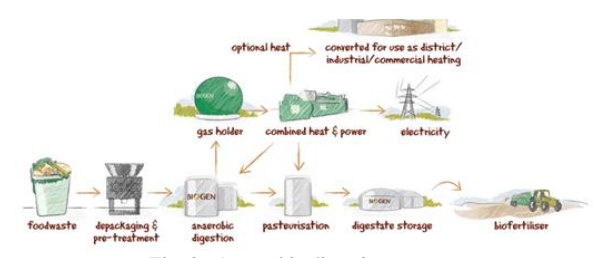
Fig. 2. Anaerobic digestion process

Similar to the recycling of inorganic materials, source separated organic wastes can be composted and the compost obtained can be used as an organic fertilizer on agricultural fields. Organic compost is rich in plant macro nutrients like Nitrogen, Phosphorous and Potassium, and other essential micro nutrients. Advantages of using organic manure in agriculture are well established and are a part of public knowledge. Life cycle impacts of extracting virgin raw materials and manufacturing make material recovery options like recycling and composting the most environment friendly methods to handle waste. They are positioned higher on the hierarchy compared to other beneficial waste handling options like energy recovery. However, quality of the compost product depends upon the quality of input waste. Composting mixed wastes results in low quality compost, which is less beneficial and has the potential to introduce heavy metals into human food chain.