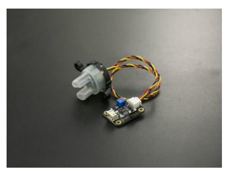
Fig. 3. Turbidity sensor

Turbidity sensors measure the amount of light that is scattered by the suspended solids in water. As the amount of total suspended solids (TSS) in water increases, the water's turbidity level (and cloudiness or haziness) increases. Turbidity sensors are used in river and stream gaging, wastewater and effluent measurements, control instrumentation for settling ponds, sediment transport research, and laboratory measurements.