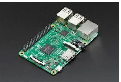
Fig. 2. Arduino

Arduino is an open-source electronics platform based on easy-to-use hardware and software. Arduino boards are able to read inputs - light on a sensor, a finger on a button, or a Twitter message - and turn it into an output - activating a motor, turning on an LED, publishing something online. You can tell your board what to do by sending a set of instructions to the microcontroller on the board. To do so you use the Arduino programming language (based on Wiring), and the Arduino Software (IDE), based on Processing.