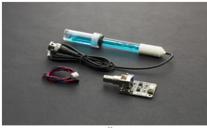
Fig. 3. P<sup>H</sup> sensor

It is used to determine the value of pH based on pH scale. It shows how water acidic is. pH stands for "power of hydrogen". pH scales from 0 to 14 where, level 0-6 is considered as acidic. Level 7 is considered as natural. Level 8-14 is considered as drinkable water.