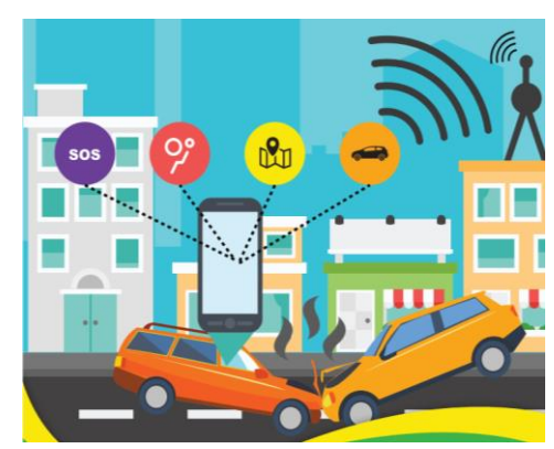
Fig. 1. Representation of connected devices

In proposed system if a vehicle has met accidents, immediately an alert message with the location coordinates is sent to the Control center with appropriate information, from the control center, a message is sent to the nearby ambulance. Also signal is transmitted to all the signals in between ambulance and vehicle location to provide RF communication between ambulance and traffic section with no wastage of time. The vehicle accident observed using vibration sensor and in the control section it is received by the micro-controller and then the nearby ambulance is received from the PC and controller sends the message to the ambulance. This project combines hardware design and sophisticated electronic control technology into a compact, reliable package. In this project a vibration sensor is used as an accident detector.